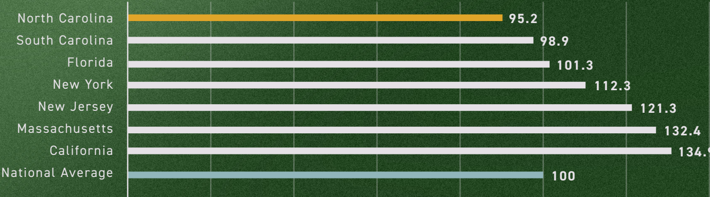
Source: C2ER 2023 State Cost of Living Index

The cost of living in North Carolina's metropolitan areas is well below the national average and that of other highly populated states.